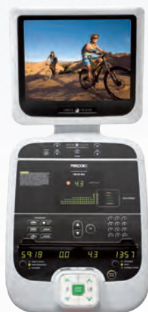
Advanced LED Console with optional 12" Personal Viewing System